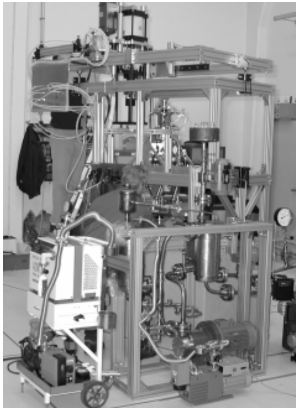
Fig. 2. Module of the LiSoR experimental facility with the thermostat at PSI.